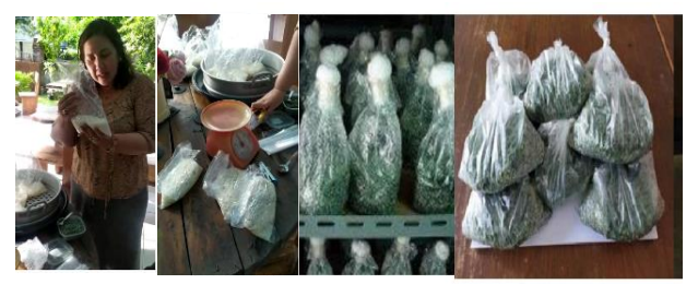
Figure 4. Results of Trichoderma propagation in Rice Media

The propagation of Trichoderma in rice or corn media. Here are the results of propagation in rice media carried out by the group (Figure 4).