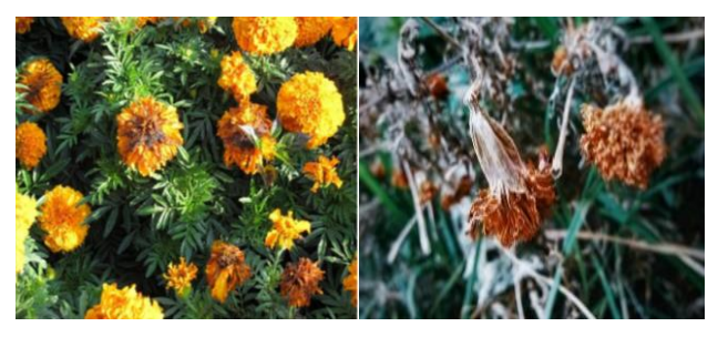
Figure 1. Diseases in Marigold Plants due to Pathogenic Fungi in Pinge Village

engineering and support. Some flower growers also often complain of low production of good flowers due to the attack of pathogenic fungi that cause flower blight (Figure 1). In Pinge Village there are Marigold flower plants that are affected by leaf blight caused by pathogenic mushrooms and partners do not yet know how to overcome the problem. In addition, in Pinge Village there are cow dung and chicken manure that has not been utilized to the maximum so that there are still many that are thrown into the river so as to damage the view of Pinge Village as a Tourist Village.