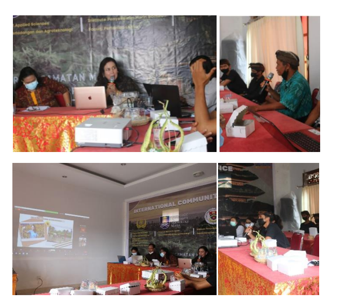
Figure 3. Provision of Material on the use of trichoderma biological agents in disease pest control in the pinge tourism village management group

Trichoderma isolation is done using dilution methods and direct insulation methods using PDA media. Mushrooms suspected of Trichoderma have characteristics such as light green color until old, hyphae spread quickly and evenly, round colony shape. Trichoderma that has grown on a PDA medium is then purified by being separated from other mushrooms and then grown on a new PDA medium. Each Trichoderma of different rizosfer origins is labeled on the petri dish and the date of purification. Macroscopic observation of fungi, namely by observing morphological shapes that include the shape of the colony, the shape of the edge of the colony, the upper surface of the colony, the color of the colony.