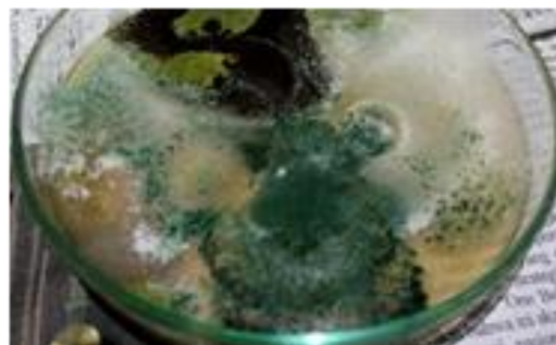
Figure 1. Invasion of Trichoderma harzianum in other fungi.

From the results of Trichoderma exploration in several places in the rice fields of Bali, Trichoderma colonies were found. When it appears after inoculation Trichoderma seen in petridish is very invasive because in addition to suppressing the growth of other fungi it can also grow on other fungi so that it can kill other fungi (Figure 1).