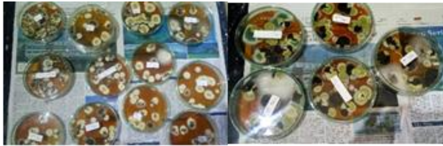
Figure 2. The emergence of Trichoderma harzianum in Sukawati (A) and the emergence of Trichoderma in Dawan (B))