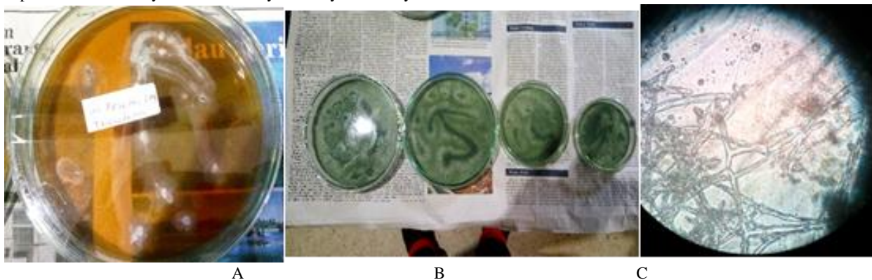
Figure 3. Trichoderma sp. colony on the first day (A) and seventh day (B) petridish. Morphology is seen on a microscope with a magnification of 1000x (C).

color development begins with white, slightly greenish-white, green, and dark after 7 days. In the research of Ref. [5], there was also a change in colony color in the identification of Trichoderma . The green color indicates that Trichoderma is ripe. The green color is usually T. koningii .